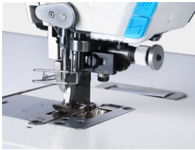
Separated cutter, good durability