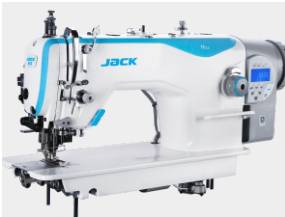
Integration of mechanical and electric, Easy to use