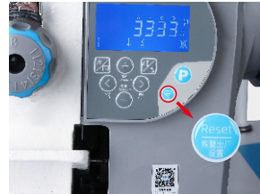
Free setting, one key reset